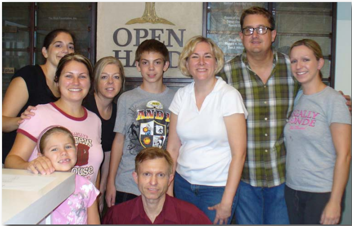
Georgia Chapter members volunteer in the Open Hands nutritional outreach program.

In August, GAPNA's Georgia Chapter showed yet again its commitment to the community by beginning a year-long volunteer program with Project Open Hand of Atlanta. Open Hand helps persons manage their chronic diseases through its nutritional outreach program which combines home-delivered meals and nutrition education as a means to reinforce the connection between informed food choices and improved quality of life. With a large percentage of their target population being older adults, the Georgia Chapter committed itself in volunteering its time, energy, and money to this worthy cause every quarter for the next year!