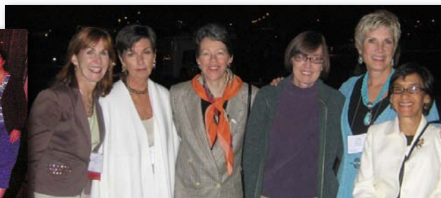
The GAPNAF Board enjoyed their ride up Sandia Peak.