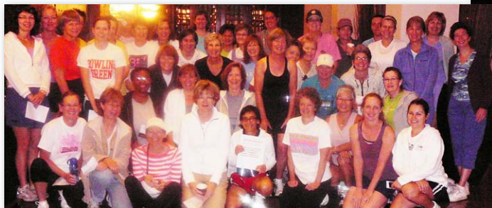
Fun Run/Walk participants stretched their legs while supporting the Foundation.