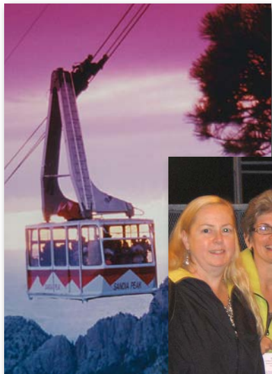
Chicago Chapter members board the Sandia Peak Tram during a GAPNA Foundation event.